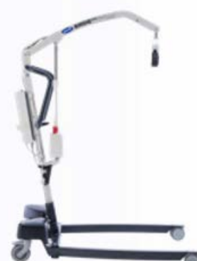
Birdie EVO XPLUS