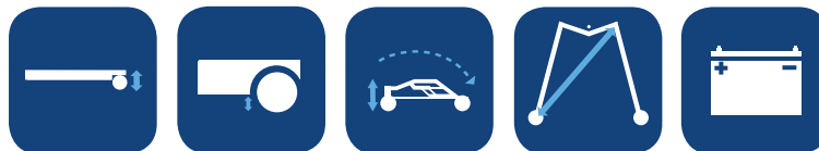
Height of legs ▼ Ground clearance ▼ Height when folded ▼ Turning diameter ▼ *Working ability ▼