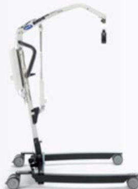
Birdie EVO COMPACT